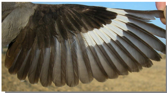
Lesser Grey Shrike. Summer. Female: pattern of wing (11-VII).