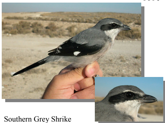
Southern Grey Shrike

Southern Grey Shrike is similar, but with bigger size; smaller white patch on wing; with white supercilium and without a black band on forehead.