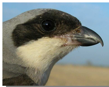
Lesser Grey Shrike. Summer. Female: head pattern (11-VII).

Summer visitor. Very scarce breeder in Eastern Huesca.