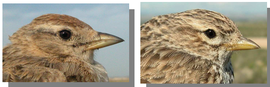
Bill pattern: left Short-toed Lark; right Lesser Short-toed Lark.