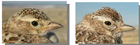
Bill pattern: left Short-toed Lark; right Lesser Short-toed Lark.