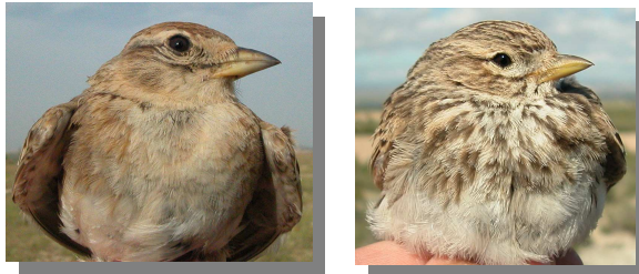
Breast pattern: left Short-toed Lark; right Lesser Short-toed Lark.

Adults can be easily identified by pattern of breast and bill, length of tertials and, in breeders, by colour of upper mandible.