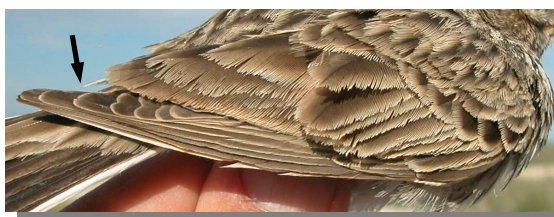
Length of tertials: top left Short-toed Lark; bottom Lesser Short-toed Lark.