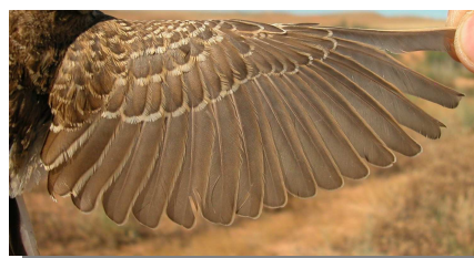
Wing pattern: top Short-toed Lark; bottom Lesser Short-toed Lark.